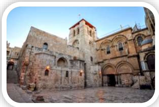
Church of the Holy Sepulchre, Jerusalem