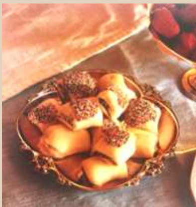
Italian Fig Cookies