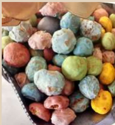
Biscotti of Many Flavors

To purchase a candle and include your petition, please call Brady at 337-962-0515.