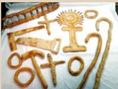
Symbolic Breads in the form of tools

Visitors are usually given a packet with a St. Joseph holy card and medal as well as a fava bean and a piece of bread. The fava bean is called the "lucky bean." Legend has it that the person who carries a "lucky bean" will never be without coins. Some people believe you should put the bread in the freezer. Then, when the next storm approaches, say a prayer break the bread and scatter it in your yard to protect your property. At the "Tupa-Tupa" (Knock Knock) meal children portray the Holy Family going to three locations looking for food and shelter. At the third door the children are welcomed by the host of the Altar to enter and refresh themselves.