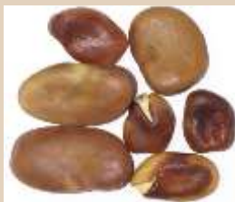
The FAVA BEAN or "Lucky Bean"